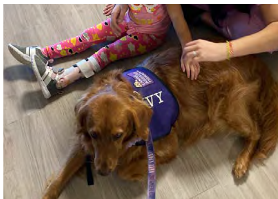
C.A.T. therapy dog, Ivy