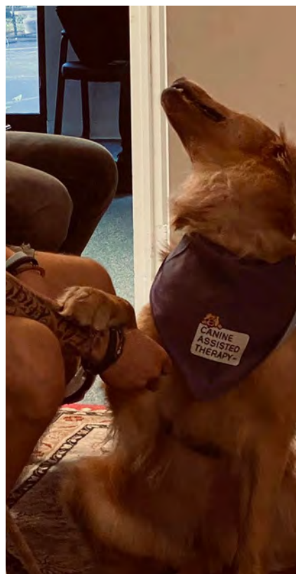
Therapy dog Mattie Mae at a treatment center

To learn more about how to become a pet therapy team with your dog, visit catdogs.org/become-a-pet-therapy-team/