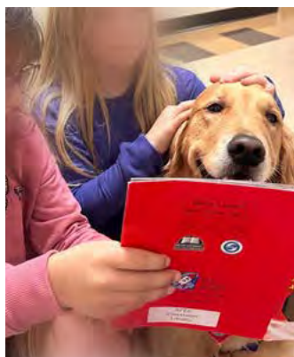
Therapy dog Pheobe Ruffay