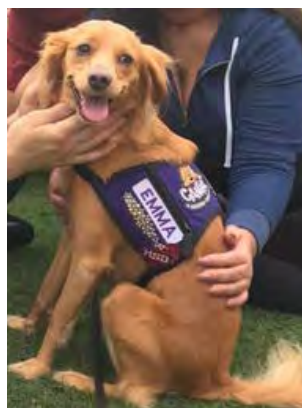
C.A.T. therapy dog, Emma

To adopt a dog from GRSF, visit goldenrescuesouthflorida.com/home .